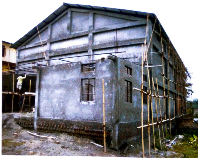
Indoor Sports Training Facility building is under construction.