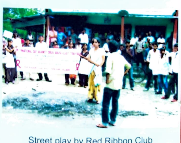
Street play by Red Ribbon Club

Sipajhar College has a "Red Ribbon Club" functioning under the aegis of the Assam State Aids Control Society (ASACS), Khanapara. The main purpose of the club is to create awareness among the students on the necessity of voluntary blood donation, blood testing, blood grouping, avoidance of intoxicants, etc. The club also offers counselling and advice on preventive measures for AIDS & HIV. Membership for students is free and voluntary.